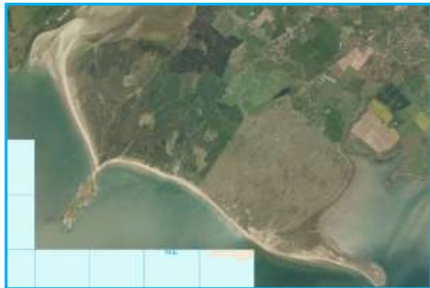
Figure 2a and b. Newborough Warren in 1947 (left side) and in 2009 (right side) The aerial photographs show a decrease in bare sand / pioneer habitats.