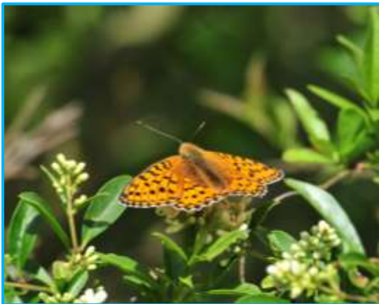
Biodiversity depends on good management.

As part of the Life+ project in the AWD sod cutting will be applied in grass and shrub encroached grey dunes at the Tonneblink, Pollenberg and Vinkenveld. Besides, sod cutting in (former) thickets of Prunus serotina and in grass and shrub encroached dune slacks will also lead to a substantial recovery of Grey dune habitat in Haasvelderduinen-Boeveld and in the middle dunes.