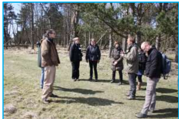
Excursion to the Haasveld pine plantation, in the AWD