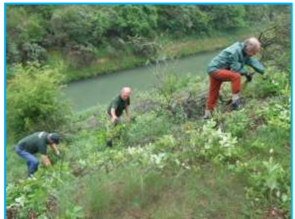
Clockwise from top left: Scrub management work at the Amsterdam Waterworks; stumps of Prunus on part of the AWD after restoration works; volunteers cutting scrub at the AWD.