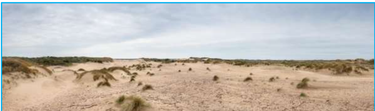
Van Limburg Stirum area